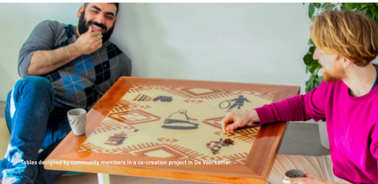
Tables designed by community members in a co-creation project in De Voorkamer.