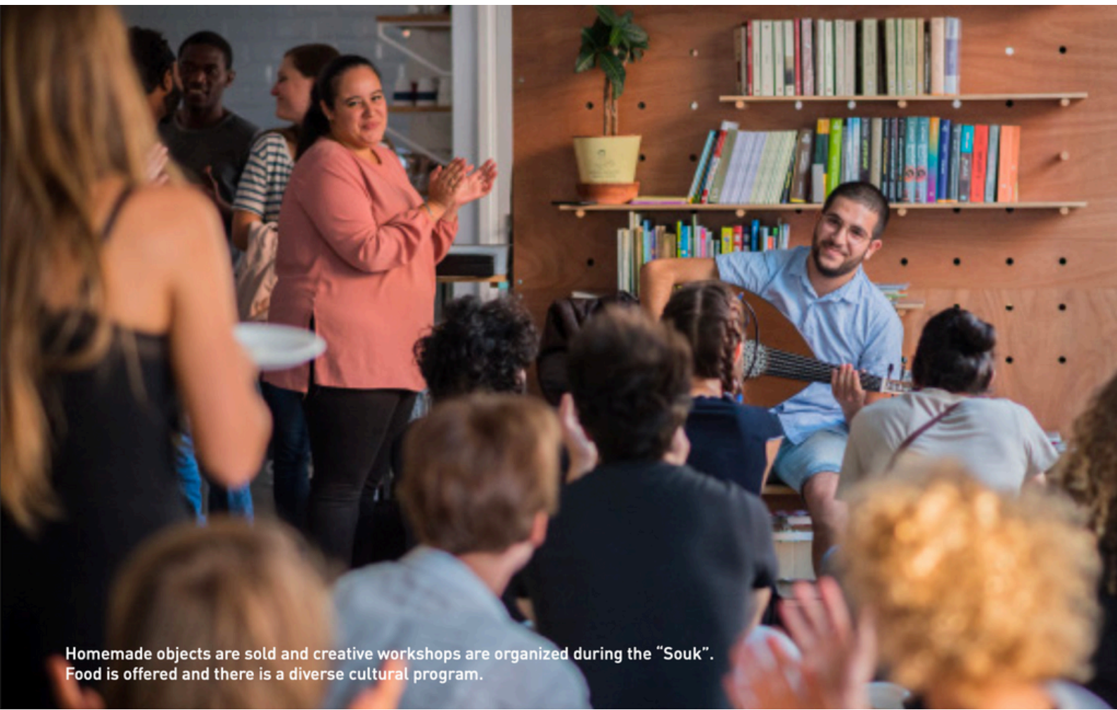
Homemade objects are sold and creative workshops are organized during the "Souk". Food is offered and there is a diverse cultural program.

We do this by working with small groups to establish creative and valuable connections through which to share and exchange inspiration and talents. In collaboration with local professionals, we design meetings and projects that bring our space to life and create events, workshops and objects that facilitate our activities. We have realised many projects born from the fascinations and interests of our community, including: our weekly language cafes and game nights, storytelling events, photography and visual art/design projects, music events and many more.