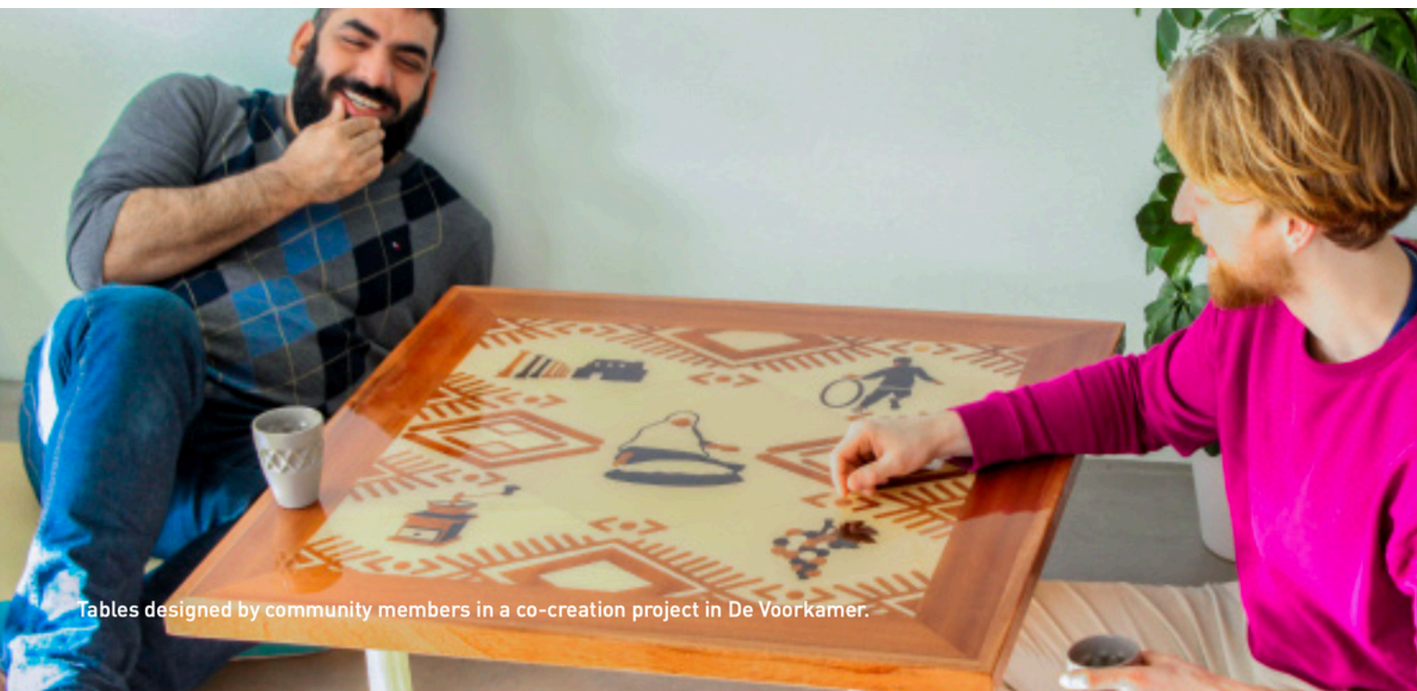
Tables designed by community members in a co-creation project in De Voorkamer.