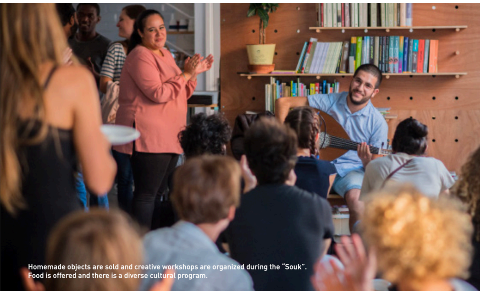
Homemade objects are sold and creative workshops are organized during the "Souk". Food is offered and there is a diverse cultural program.

We do this by working with small groups to establish creative and valuable connections through which to share and exchange inspiration and talents. In collaboration with local professionals, we design meetings and projects that bring our space to life and create events, workshops and objects that facilitate our activities. We have realised many projects born from the fascinations and interests of our community, including: our weekly language cafes and game nights, storytelling events, photography and visual art/design projects, music events and many more.