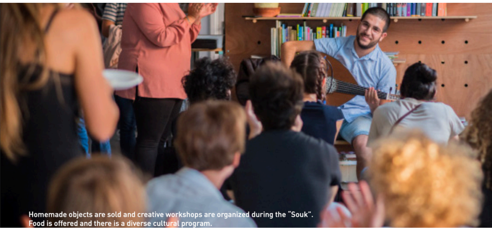
Homemade objects are sold and creative workshops are organized during the "Souk". Food is offered and there is a diverse cultural program.